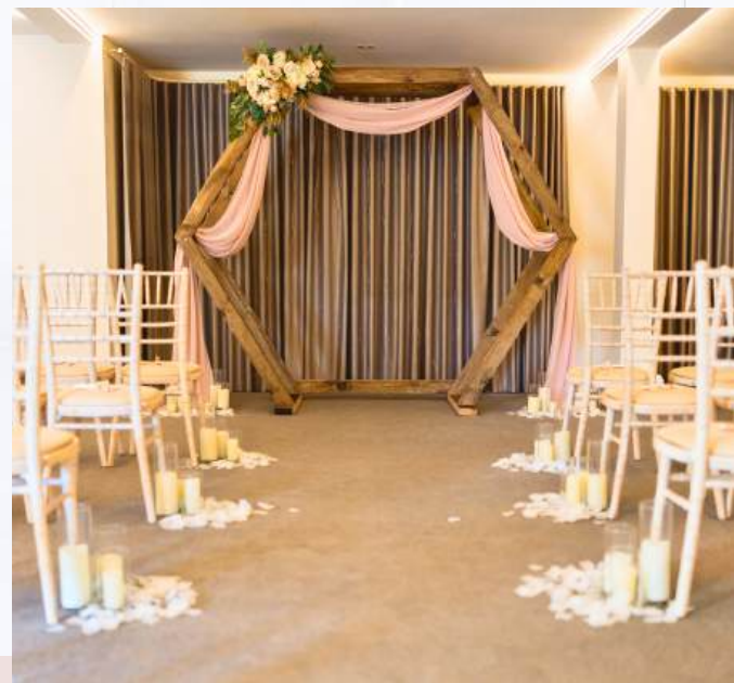
The Orchard Room

Please kindly note that booking the registrar is the responsibility of the couple-to-be and will incur a separate registration fee payable directly to the registrar.