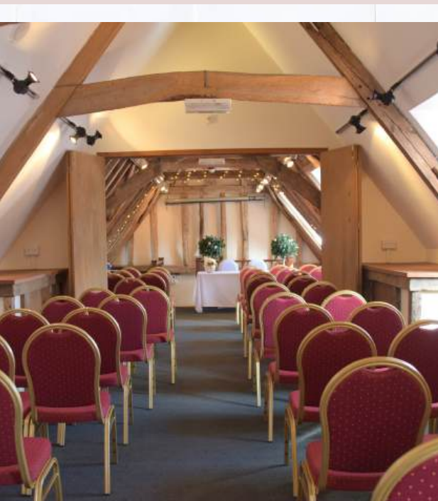
The Oak Rooms

The Oak Rooms are situated a 3-min walk from Applewood Hall in the Appleyard Courtyard next to a small meadow that can be used for photos and next to the Banham Barrel pub.